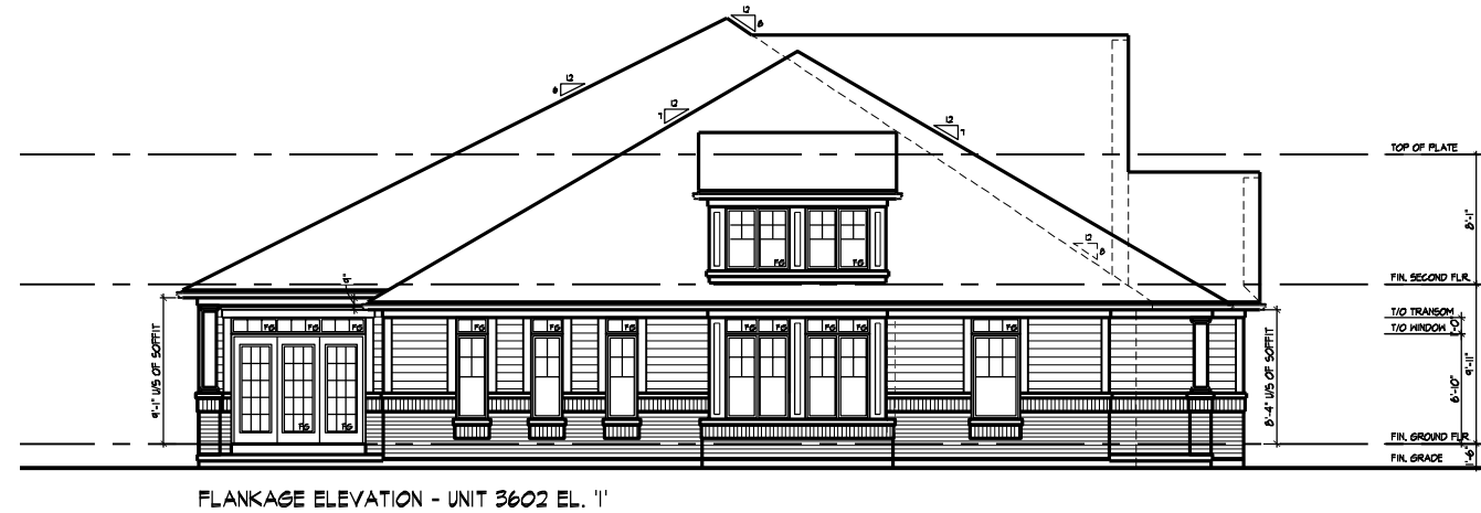
FLANKAGE ELEVATION - UNIT 3602 EL. '1'