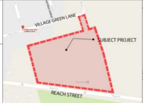
KEY MAP - NOT TO SCALE